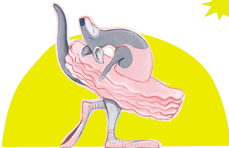
Illustration by Bruce Whatley

“Josephine Wants to Dance brings the story of a stage-struck macropod to life with enormous charm and sly wit.”