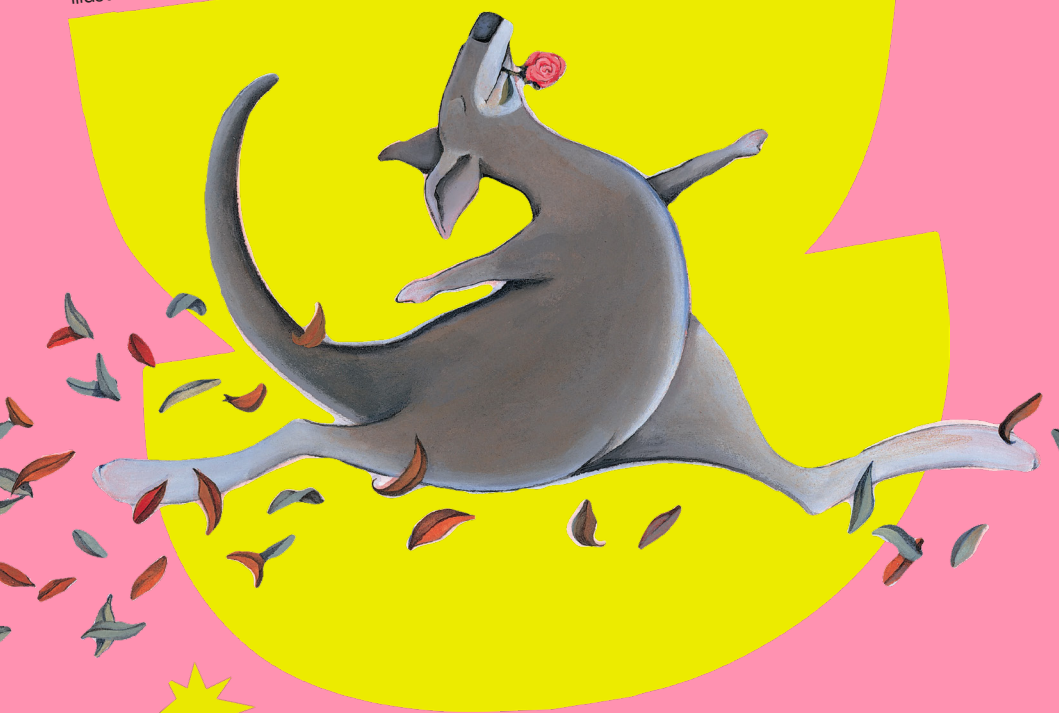
Illustration by Bruce Whatley