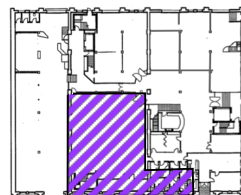
GROUND FLOOR LEVEL LOCATION PLAN